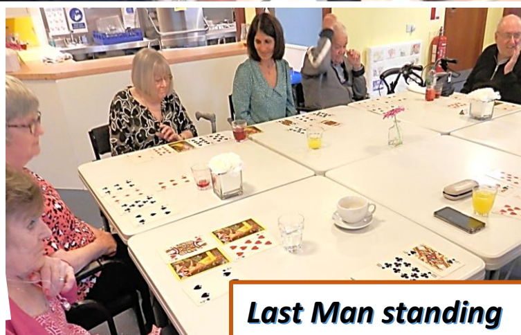
Last Man standing