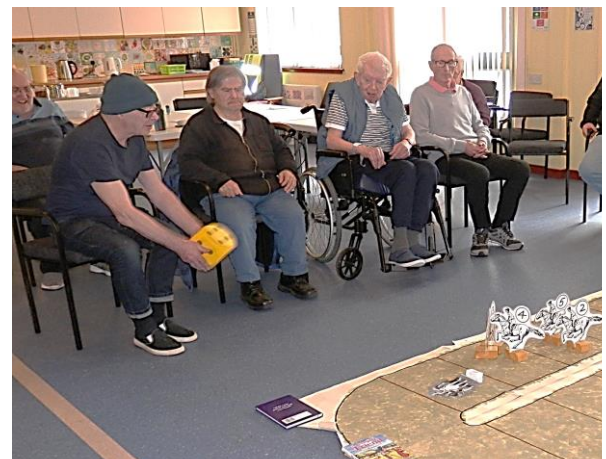
And the Winners were Red Rum, Arkle and The Carpenter